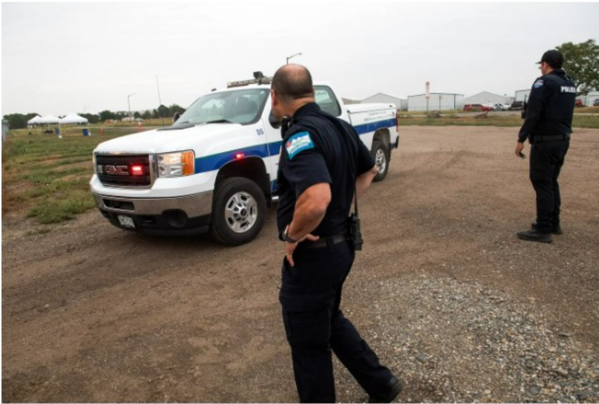
Fire crews respond during an emergency drill at the Northern Colorado Regional Airport on Sept. 5, 2025, in Loveland, Colo.