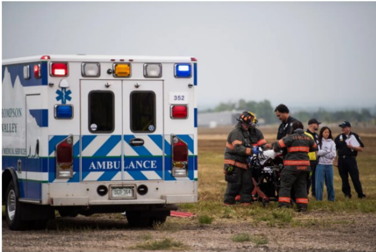
EMS responds during an emergency drill at the Northern Colorado Regional Airport on Sept. 5, 2025, in Loveland, Colo.